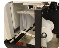
Poly tubing greatly reduces material costs