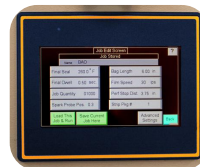
Change bag length at the push of a button or via an input